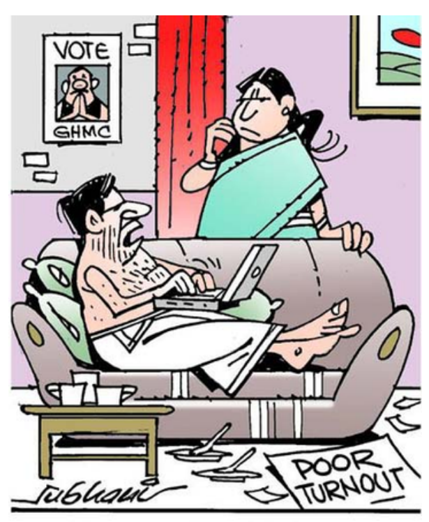
The EC should give us the 'Vote From Home' option!